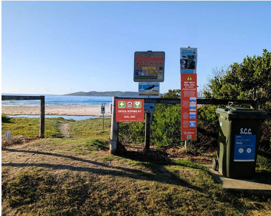
Figure 2 Addition of a Rescue Station, Rescue Tube Station, remove top of post, relocate signs. The Rescue tube box will be behind the horizontal rail, the ABC... sign is a duplication, but could be instated if required. Council to confirm.