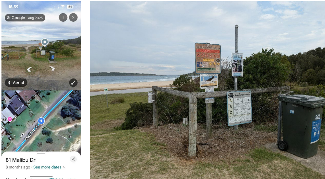
Figure 1-Current Signage Murramarang Beach

Sited as an easy access point, at the location of existing signage and infrastructure.