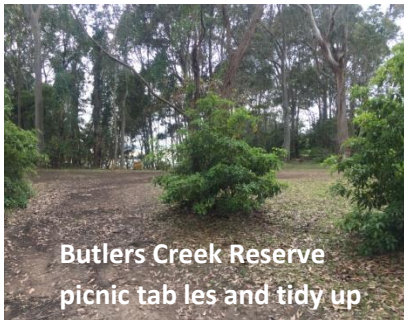
Butlers Creek Reserve picnic tables and tidy up