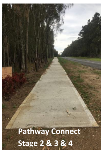
Pathway Connect Stage 2 & 3 & 4