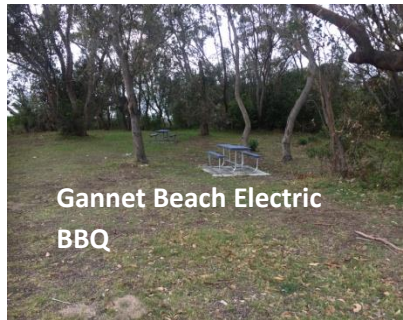
Gannet Beach Electric BBQ