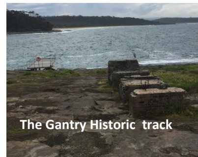
The Gantry Historic track