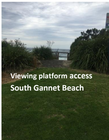
Viewing platform access South Gannet Beach

The following set of projects, originally presented to the Community in 2018, was established to increase recreation and community infrastructure. Over the past 3 years some projects have been altered and achieved while others continue being planned and considered.