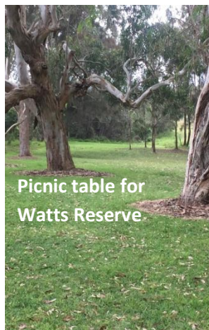
Picnic table for Watts Reserve